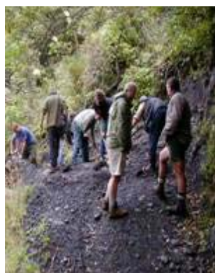
A 4WD group getting involved in track maintenance.

Good scenery and bird life. Further information: reference 2. p 135