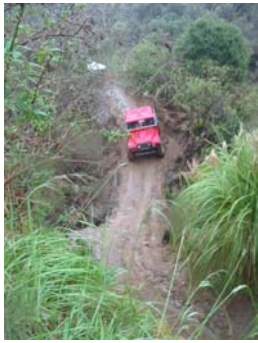
Enjoying a trip on the 42 nd Traverse.

Further information: Wairarapa Area Office, Ph 06 377 0700, email wairapaa@doc.govt.nz and reference 1. p 207