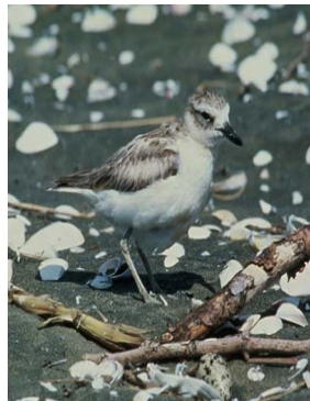
Please avoid driving on beaches which are home to wading and migratory birds, some of them critically endangered such as the New Zealand dotterel.