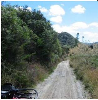
View of the 42 nd Traverse from a quad bike.